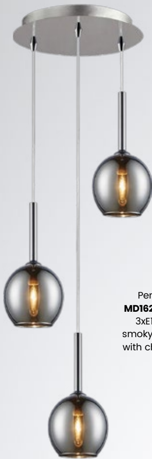
MONIC Pendant lamp MD1629-3B Chrome 3xE14 MAX 40W smoky chrome glass with chrome canopy