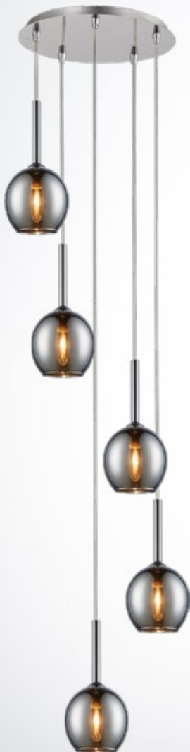
MONIC Pendant lamp MD1629-5B Chrome 5xE14 MAX 40W smoky chrome glass with chrome canopy