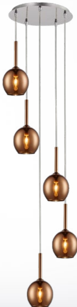
MONIC Pendant lamp MD1629-5B Copper 5xE14 MAX 40W copper glass with chrome canopy