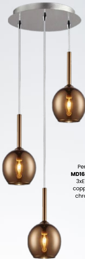
MONIC Pendant lamp MD1629-3B Copper 3xE14 MAX 40W copper glass with chrome canopy